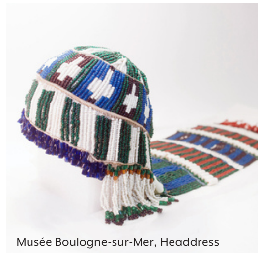
Musée Boulogne-sur-Mer, Headdress