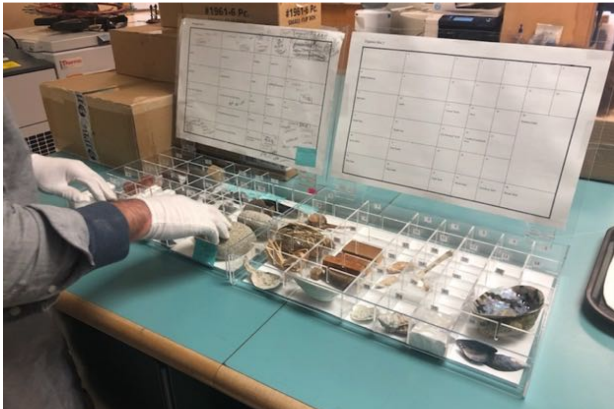
Figure 10.3. Raw material kit in the Alutiiq Museum laboratory

As the great majority of our material identifications were based on visual examination, all affiliations should be considered provisional. As with our artifact classification, our raw material identifications are broad categories informed by environmental knowledge. There are many ways these categories could be refined. They are offered as a framework for understanding the broad geographic affiliation of the raw materials used in ancestral Alutiiq manufacturing.