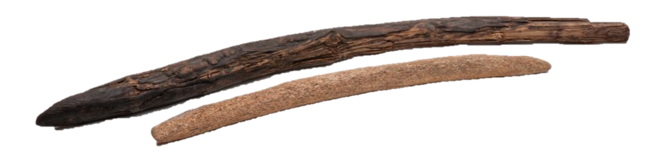
Digging sticks from the Uyak site (AM3)