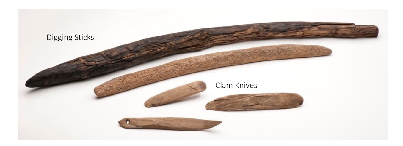
Figure 8.10. Digging sticks (top) and clam knives (bottom) from Karluk One (AM193).

m = term in modern usage, c = term created by Elder Alutiiq speakers