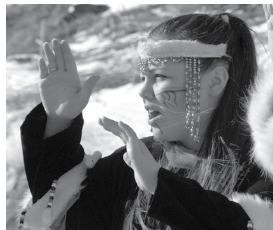
A Kodiak Alutiiq dancer performs with hand motions.

The louse whisked himself. / He whisked himself long and hard [showing off] / The baby louse [nit] splashed water on the rocks. / And the louse sang to his little self [for the heck of it].