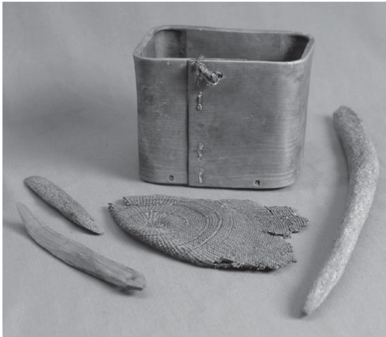
Objects for Clamming – wooden knives for opening clams (left), spruce root basket (center front), bentwood box (center back), sea mammal bone digging stick (right). Koniag, Inc. collection, Karluk One, ca. 1400 – 1750 AD.

In the 1980s and 90s, archaeologists worked with community