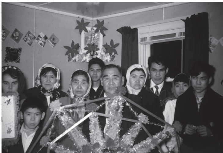
Starring in Karluk, ca. 1959.