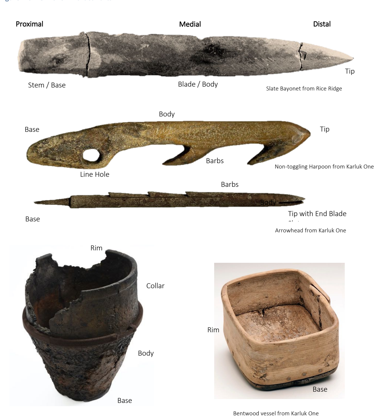
Figure 1.6. Terms for Artifact Parts.

Many of the artifacts in Alutiiq assemblages are broken. They are fragments of tools that disintegrated with time or were discarded because they were broken during use, manufacture, or refurbishing. Table 1.3 shares Alutiiq terms for object parts and Figure 1.6 illustrates the locations of these parts for select tools. We record the part of the tool present in the condition column of our catalogs.