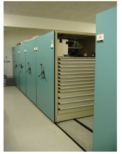
Figure 1.1. Alutiiq Museum collections storage

OB = Ocean Bay Tradition, Ka = Kachemak Tradition, Ko = Koniag Tradition, H = Historic