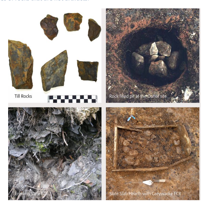
Figure 1.4. Examples of rocks that are not artifacts.