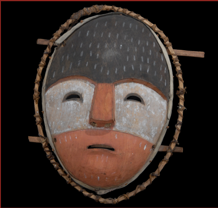
Ingillagayak—Weatherman, wooden mask, Pinart collection, Musee Boulogne-sur-Mer, France. 988-2-198.