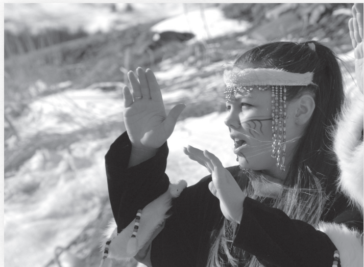
A Kodiak Alutiiq dancer performs with hand motions.

The louse whisked himself. / He whisked himself long and hard [showing off] / The baby louse [nit] splashed water on the rocks. / And the louse sang to his little self [for the heck of it].