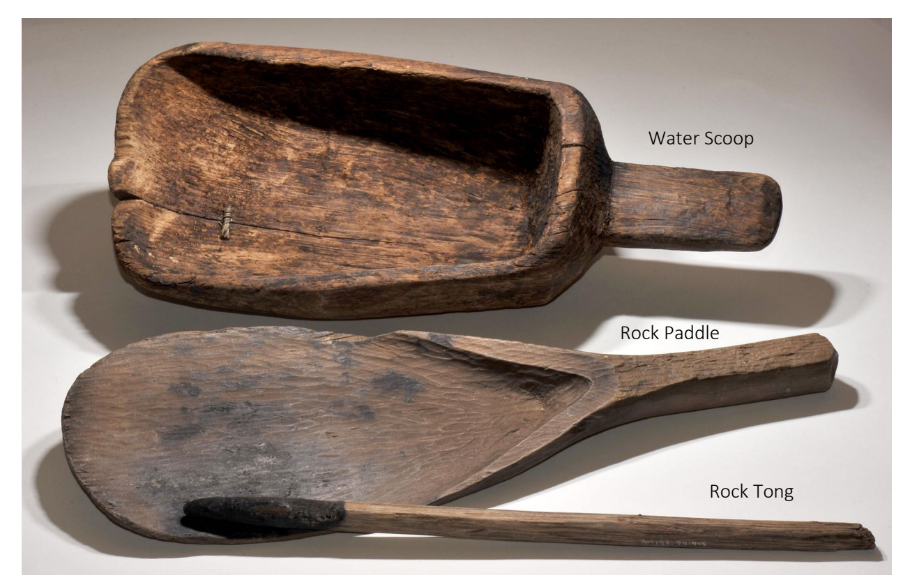
Figure 8.19. Steam bathing tool from Karluk One (AM193).